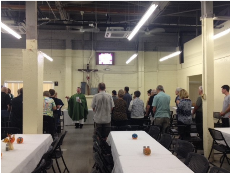
Volunteer Appreciation Mass, November 6, 2016