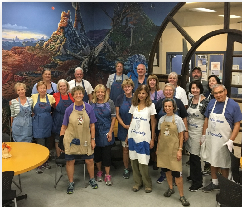
Monday night crew!